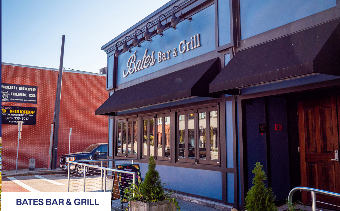
BATES BAR & GRILL